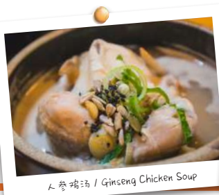
人参鸡汤 / Ginseng Chicken Soup