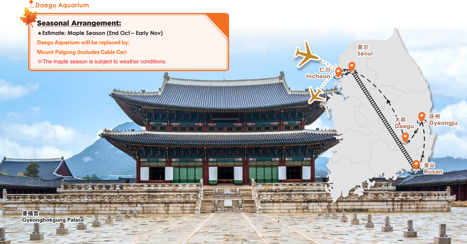
景福宮 Gyeongbokgung Palace

※ Sequence of the itinerary is subject to change according to the final flight confirmation.