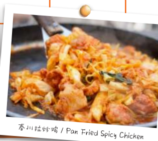
春川辣炒鸡 / Pan Fried Spicy Chicken