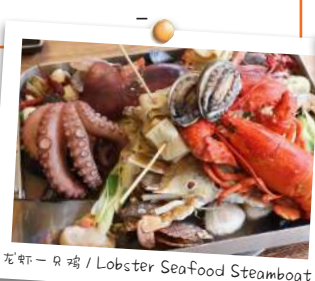
龙虾一只鸡 / Lobster Seafood Steamboat